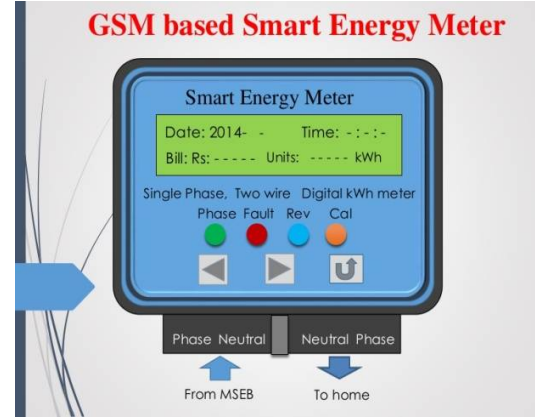
Fig.1: Smart Energy Meter