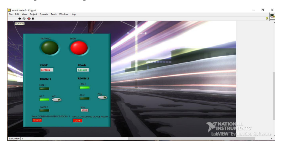
Fig 6:Maximum power consumption by AC1 & FAN2 under overload

When overload occurs in room-2, the maximum power consumption is recorded by AC 1 & FAN 2 and indicates HIGH that is red LED glows as shown in Fig 6.