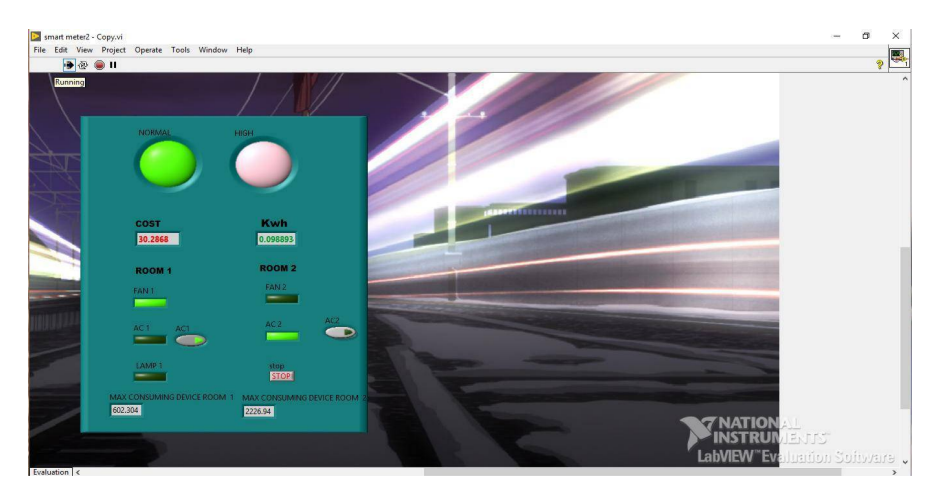
Fig 5: Maximum power consumption by AC2 & FAN1

When AC 2 in room-2 is in operation and AC 1 in room-1 is not in operation, the maximum consumption is recorded by AC 2 in room-2 and FAN 1 in room-1 and indicates NORMAL that is green LED glows as shown in Fig 5.