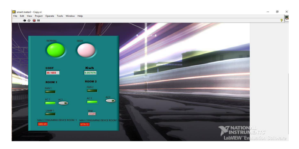
Fig.3:Maximum power consumption under two ACs

When two ACs are in operation, the maximum power consumption is recorded by two ACs and indicates NORMAL that is green LED glows as shown in Fig 3.